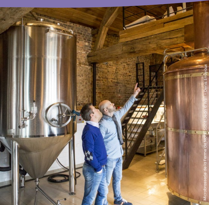
Microbrasserie de la Ferme de Mont-Saint-Leon