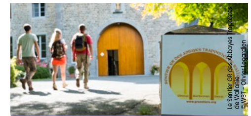
Le Sentier GR des Abbayes Trappistes de Wallonie

Orval 1 • 6823 Villers-devant-Orval (Florenville) +32 (0) 61 31 10 60 • www.orval.be