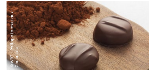
© WBT - Philippe Lemusciaux - Chocolatier