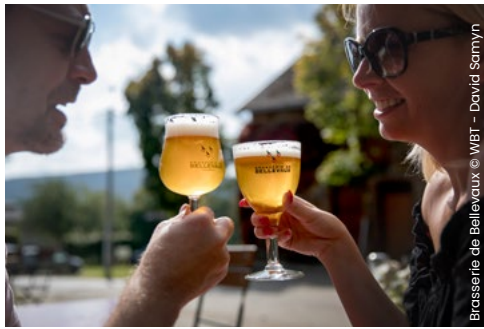
Brasserie de Belleaux