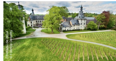
Chateau de Bioul

Place Vaxelaire 1 • 5537 Bioul (Anhée) +32 (0) 71 79 99 43 www.chateaubioul.be