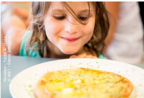
Nivelles - Tarte Al Djote