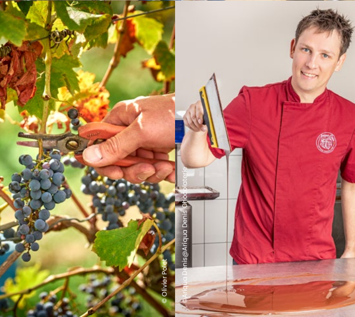
© Olivier Pollet Artiqua Denis@Artiqua Denis Chocolate

As a food lover's paradise, Wallonia is warm and welcoming. The richness of the region, the quality and diversity of its products, but also the creativity and expertise of its artisans and producers are all assets for a different tour of our regions. This map offers a selection of 40 producers, allowing you to discover their work, the stages of production and the possibility of tasting their produce. Sharing their human passions and values.