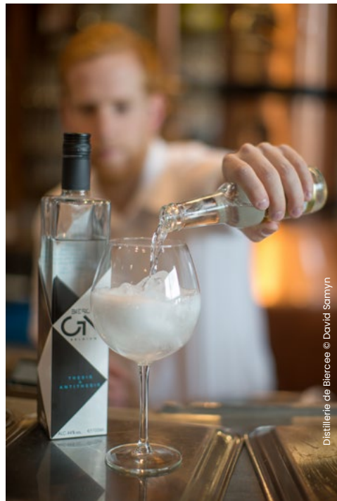
Distillerie de Biercée

Specialities: Eau de Villée, Poire Williams N°1, P'tit Peket